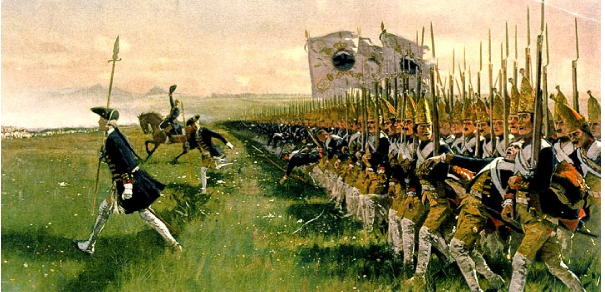
Carl Röchling (d. 1920), Attack of the Prussian Infantry